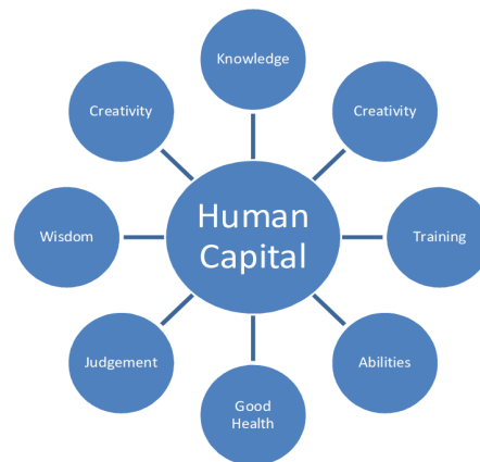
Figure 1 : Elements of Human Capital

expertise and industry knowledge to help them create easy integration into their roles is very crucial. Structured onboarding is often the reason organizations avoid these and many other negative side effects.